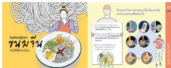
Fig. 3. Introduction of pH monitoring methods for fermented rice noodles in the form of a booklet written in Thai

Japan International Research Center for Agricultural Sciences