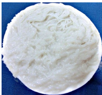
Fig.1. Fermented rice noodles recalled from the market before selling due to the liquefaction

In addition to the technology to control liquefaction of the product, the use of a booklet (Fig. 3) that explains the production process and cooking method in simple local language will improve the profitability of producers, reduce food loss, and promote dietary education.