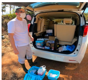
Fig. 2. A rapid diagnosis is conducted by carrying a portable set of necessary items to the farm.