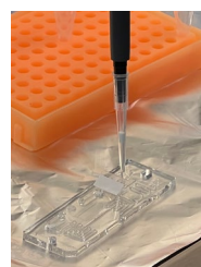
Mix the mashed lesion tissue with the reaction reagent and load it into the measuring chip.