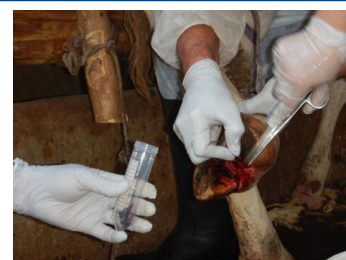
Collecting lesion tissue on the farm