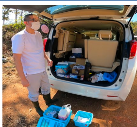
Fig. 2. A rapid diagnosis is conducted by carrying a portable set of necessary items to the farm.