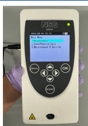
Fig. 1. Portable gene amplification device PicoGene® PCR1100

Foot-and-mouth disease (FMD) is a highly contagious transboundary infectious disease that affects cattle and swine. In countries where FMD has occurred, economic losses have been enormous due to the reduced productivity of livestock and restrictions on the export of livestock products. We developed a simple, rapid genetic diagnosis method for FMD using a portable device (Fig. 1). The device can be powered by a portable smartphone battery, which allows diagnosis on site (Fig. 2). Using this portable gene amplification device, FMD can be diagnosed with high sensitivity within 20 minutes using tissues collected from animals with suspected infections on the farm (Fig. 3). Furthermore, the system can be applied to diagnostic methods using dried reagents that do not require refrigeration, even under hot and humid climatic conditions. Compared with conventional FMD viral antigen detection kits, this technology can detect the virus with high sensitivity, and this diagnostic method will enable rapid identification of FMD-positive farms and highly effective quarantine measures. Currently, operational procedures and manuals are being developed and preparations for implementation are underway in Thailand.