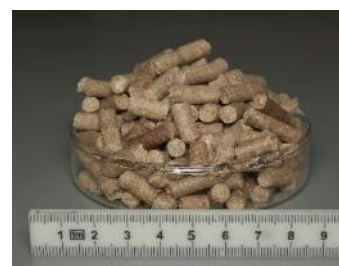
Fig. 5. Pellets produced from dry matter of JES1