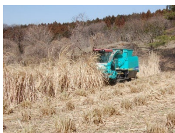
Fig. 4. Harvesting via forage harvester