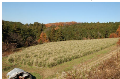
Fig. 3. Practical cultivation of JES1 in Sakura City, Tochigi Pref., Japan