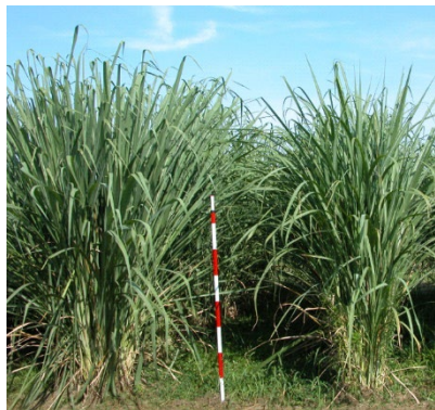
Fig. 1. Plant: Growth habitat of JES1 (Kumamoto Pref., Japan)

Erianthus arundinaceus , a perennial grass that is widely distributed in Asian regions, can be used as a new biomass crop owing to its high biomass productivity. The novel Erianthus cultivar JES1 was registered in Japan in 2019 (Fig. 1). This cultivar can be grown in the Kanto region (37°N) and southward in Japan and produce an annual dry matter yield of more than 20 t/ha (Fig. 2). After planting, the cultivar can be grown continuously for ratoon cultivation for more than five years, allowing low-cost cultivation. Practical cultivation of JES1 has been implemented in Sakura City, Tochigi Pref. (Figs. 3 and 4). The biomass has been converted into pellets (Fig. 5) used for bioenergy production. The use of Erianthus as breeding or material resources can be applied to other Asian regions that are considering the use of biomass crops.