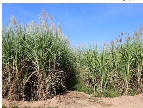
Fig. 1. The growth at second ratooning in Kosum Phisai of Northeast Thailand (December 2014)

* Bagasse is the fibrous material that remains after crushing sugarcane stalks to extract the juice. This material is used as a raw material for electricity production.