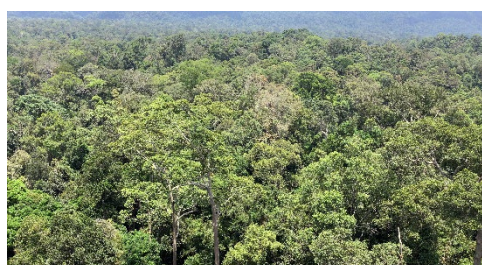
Fig. 1. Malaysian lowland dipterocarp tropical rainforest

The minimum cutting size of the selective logging criteria for dipterocarp timbers in Malaysia is 50 cm in diameter; however, it remains unknown whether healthy seed production occurs in secondary forests after harvesting according to this criterion. Therefore, we have developed a method to estimate the ratio of outcrossing pollen after selective logging using simulation with pollen dispersal pattern and the amount of flowering of the four timber species as parameters. The current minimum cutting size maintains approximately 30–80% of outcrossing pollen ratios in fast-growing species, while that in slow-growing species is reduced to < 20% (Fig. 2, Table 1). Thus, it is necessary to establish a more stringent selection criterion for the slow-growing species.