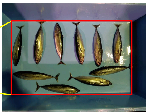
Fig. 1. A capture scene using ToroCam