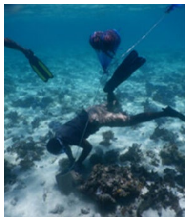
Fig. 2 Deploying wild seedling collectors by snorkeling