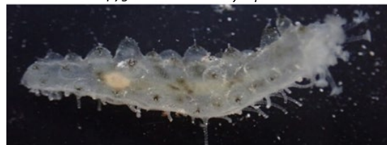
Dragonfish Stichopus cf. horrens