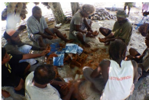
Fig. 1 Removing coconut fiber from the husk

Wild seedling collection is a method of naturally attaching juveniles of invertebrates to materials moored in the sea. Examples of wild seedling collection have been reported for two Apostichopus species of temperate sea cucumbers, but not for tropical sea cucumbers. A tank experiment using hatchery-produced juveniles of the tropical sea cucumber, Stichopus horrens , showed that seedling collection efficiency of coconut fiber and mesh fabric was higher than that of oyster shells. Subsequently, simple seedling collectors filled with coconut fiber (Fig. 1) were moored in the sea for three months (Fig. 2), and multiple species of juvenile sea cucumbers were collected (Fig. 3). The collectors can be made cheaply using husks of commonly consumed coconuts and can be easily installed. Thus, we anticipate widespread adoption among the local fishing community to replenish the sea cucumber resources.