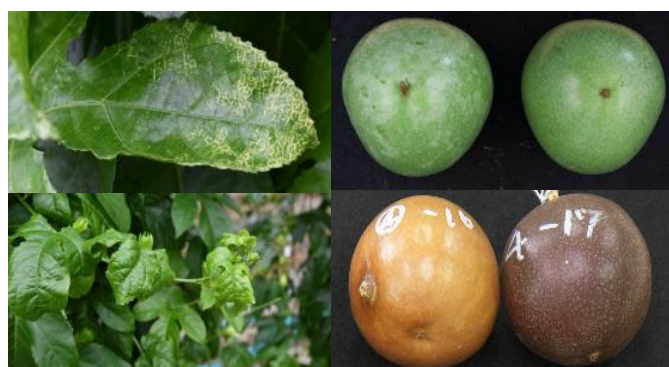
Fig. 1. Viral infection-like symptoms observed in the leaves and fruits of passion fruit

In Asia, passion fruit ( Passiflora edulis ) is produced mainly in Indonesia, India, and Vietnam. Recently, passion fruit production is gaining attention as an alternative crop to tackle climate change in Japan. However, the occurrence of Passiflora latent virus (PLV) diseases is a major problem concern (Fig. 1). Virus infection can spread easily due to vegetative propagation via cuttings. Thus, securing virus-free plants is difficult due to infection of the mother stock used for propagation. We established a method for virus-free propagation of passion fruit from PLV-infected plants using a simple shoot-tip grafting method that can be easily introduced into the field without any aseptic technique and facility (Fig. 2). This method may be effective against other viruses and viral infection related symptoms of unknown cause in the production countries for the propagation of healthy seedlings.