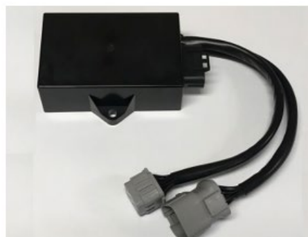
Fig. 3. Commercially available general-purpose electronic control unit (ECU)