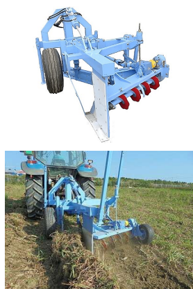
Fig. 1. Cut-Soiler

** Gravel layer: a layer formed of sand and pebbles.