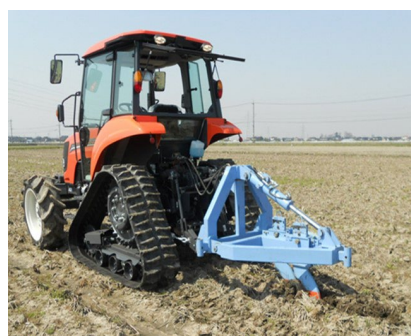
Fig. 2. Drilling unit in operation