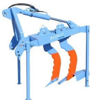
Fig. 1. Drilling unit of “Cut Drain”

However, the application of “Cut Drain” is limited to the clay soil type. The development of inexpensive grade units is currently under consideration for overseas countries.