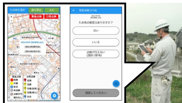
Fig. 2. Irrigation Pond Management App

Fig. 1. Disaster prevention support system for irrigation pond