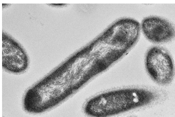
Fig. 1. Electron micrograph of saccharifying bacteria

Agricultural waste generated from food and agricultural industries is difficult to decompose and is a source of GHG emissions. Microbial saccharification (Fig. 2) is a novel enzyme-free saccharification method that can saccharify and solubilize agricultural residues using only microorganisms without cellulolytic enzymes. In this method, agricultural residues are efficiently decomposed into sugars and organic acids and can be converted into CH 4 and H 2 . Additionally, CO 2 and H 2 generated through microbial saccharification and methane fermentation can produce methane again through the bio-methanation process to facilitate energy recycling of unused agricultural residues without GHG emissions.