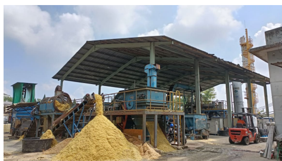
Fig. 3. Demonstration pilot plant in Kluang, Johor, Malaysia