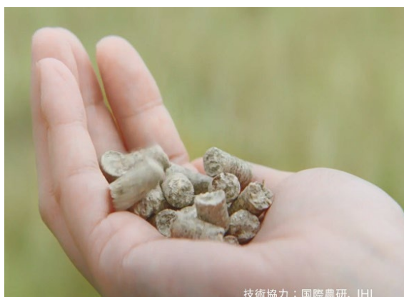
Fig. 1. Furniture pellets made from oil palm trunks

To promote the sustainable utilization of diverse and enormous amounts of unused biomass discharged from the oil palm industry, we have developed a manufacturing technology called “Multi-Biomass Treatment Process” that facilitates the conversion of oil palm trunks, empty fruit bunches, fronds, and fibers into energy and wood substitutes (Fig. 2). The technology has been demonstrated at a full-scale level at a pilot plant in Johor, Malaysia (Fig. 3). Currently, we have started a procurement test for sustainable fuel pellets and furniture materials from oil palm trunks and empty fruit bunches with the cooperation of a palm oil mill in Sarawak.