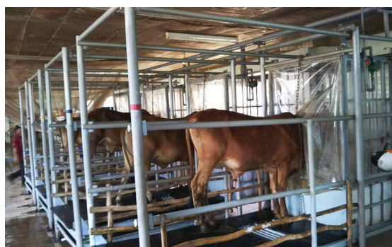
Fig. 1. Vietnamese local cattle (Lai Sind) and methane emission measurement

This technology can be widely applied for zebu cattle ( Bos indicus ), which are common in the tropical region.