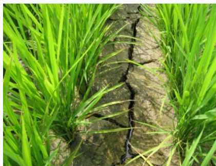
Fig. 1. Paddy field under midseason drainage

Note: As the amount of cadmium absorbed by rice plants may increase in areas with high concentrations of cadmium in the paddy soil, this method is not recommended for such areas. For arsenic in the paddy soil, prolonging mid-season drainage is expected to decrease the absorption of arsenic by rice.