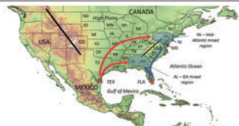
Fig. 1 Map identifying winter-brooding Texas (TEX) and Florida (FLA) fall armyworm populations and significant geographic features of the USA east of the Rocky Mountains (narrow line = Appalachian Mountains, wide line = Rocky Mountains)