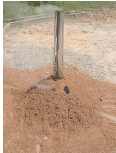
Figure 1 Biochar making using a Kun-tan maker.

Biochar was produced using the Kun-tan method by using a Kun-tan maker (E-460S; Honma Co. Ltd., Niigata, Japan). The Kun-tan method can make biochar through low-temperature carbonization (see JIRCAS, 2014). The process involves five basic steps: (1) Fire is set. (2) The fire is covered with a kantan maker. (3) Rice husk and/or saw dust are poured around the Kuntan maker. (4) The material is churned occasionally after charring commences. (5) The material changes color from brown to black, indicating completion of charring. The matured biochar is spread on a hard surface and watered to cool. The material can be applied to the field immediately or stored for application later. Powdered or granular organic materials need to be selected for the Kun-tan method.