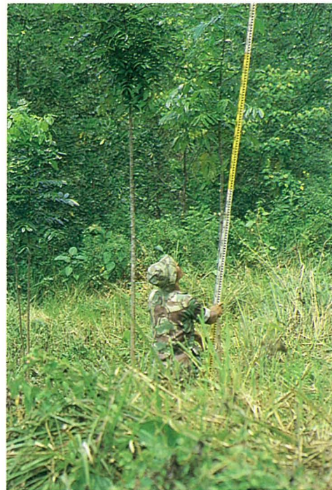
Plate 2. Young mahogany trees, Swietenia macrophylla , that were not attacked by the shoot borer, Hypsipyla robusta , in the experimental plantation enclosed by Acacia mangium (Benakat, South Sumatra, May, 1994)

and remained short, while the height of 61 (32.6%) of the surviving 187 trees exceeded 2 m in May 1994 and that of 99 (56.3%) and 53 (30.1%) of the surviving 176 trees exceeded 3 m and 4 m, respectively, in June 1995. The maximum tree height recorded was 7.0 m in 1995. The surrounding A. mangium trees planted together with the mahogany trees reached a height of ca. 10 m in 1995.