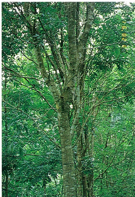
Plate 1. Ten-year-old mahogany trees, Swietenia macrophylla , with frequent branching of the bole due to earlier attack by the shoot borer, Hypsipyla robusta (Benakat, South Sumatra, March 1991)

In the Benakat Trial Plantation (located in the South Sumatra Province, Indonesia) of Palembang Reforestation Technology Centre (Agency for Forestry Research and Development, Ministry of Forestry, Indonesia), mahogany ( Swietenia macrophylla ) stands so far planted had been always attacked by H. robusta , and the attack usually started within two years, mostly within a year, after planting 3, 14) . Based on experiments, Sutomo 14) demonstrated that weeds left uncut around the mahogany could be a physical barrier against the attack by the shoot borer until the height of the trees exceeded that of surrounding weeds. Furthermore, one mahogany stand surrounded by a plantation of an acacia tree, Acacia mangium , and